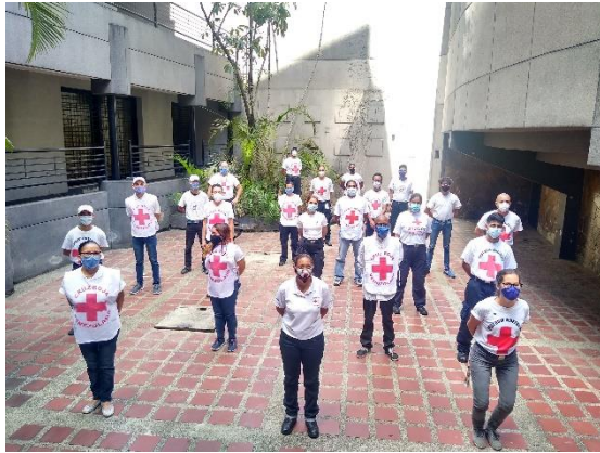
Vector control Training – Caracas branch, July 2020.

where 54 volunteers and staff of the Venezuelan Red Cross from different parts of the territory participated . In addition to the above, two trainings in vector control were conducted , which were adapted to a virtual modality, maintaining academic rigor, and reached 26 participants .