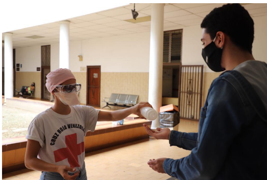
Hand disinfection at the Venezuela Red Cross Hospital Triage in Caracas. July 2020. Capital District Branch.

March 2020: First COVID-19 cases reported by the Venezuelan Government