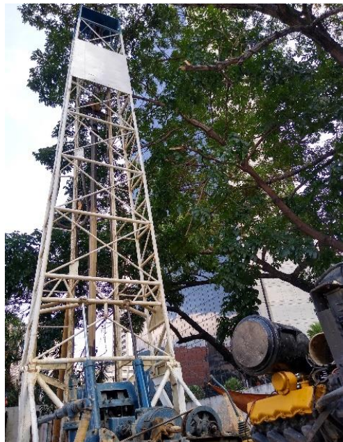
The VRC is building a deep well in the VRC in the Capital District.

Complementary to what was reported in the previous reporting period, terms of reference were launched for the construction of a deep well for the capture of subterranean water and supply of drinking water to the VRC hospital and the administrative headquarters in La Candelaria, Capital District. The construction of the well has been completed and is currently operational. The well has a depth of 130mts and a capacity of 2.9 litres/Seg, which meets the hospital's water needs, according to the number of patients and the amount of water per patient (150liters) according to Venezuelan standards. At present, works are being carried out to protect the control box of the ignition system and the control panel of the well. In addition, the operation is in the process of purchasing sand filters to guarantee that the water is suitable for hospital use. During the month of September, a WASH and safe water induction was carried out, as well as on the maintenance system of the distribution networks, for the water and sanitation and maintenance personnel of the Carlos J Bello Hospital. This process involved 16 people, including technicians and volunteers from the Capital District branch.